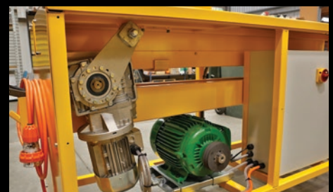
Sturdy powder coated construction.