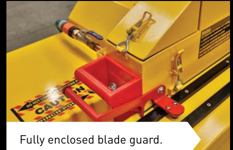
Fully enclosed blade guard.

12 months written warranty applies on motor and gearbox components under normal operating conditions. Replaceable components such as chains and blades are not covered by the warranty. The use of Non-Almonte blades and consumables can cause unseen damage and will void warranty.