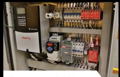
Computer controlled drives.