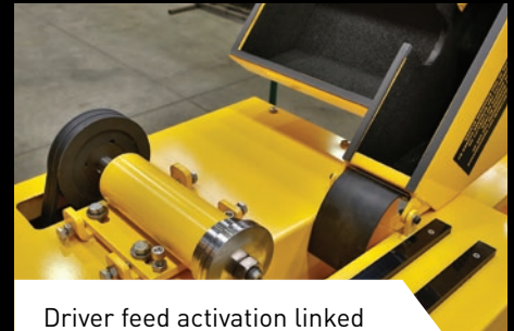
Driver feed activation linked to blade operation.