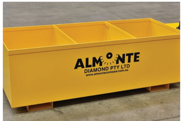
ALMONTE CORE SAW RECYCLING UNIT

Cat 4 - The Almonte Core Saw qualifies for a Category 4 rating.